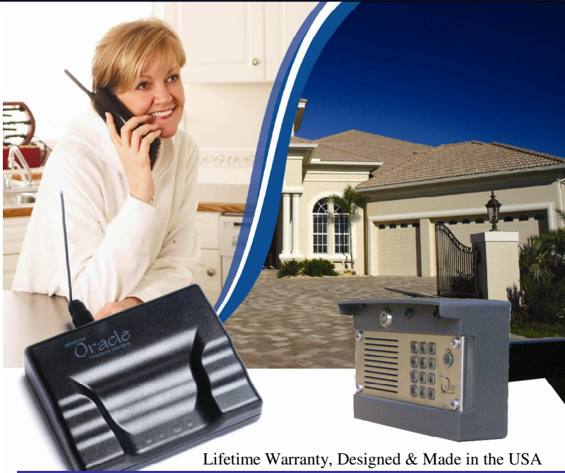
Lifetime Warranty, Designed & Made in the USA